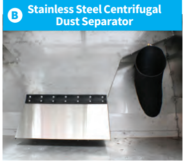
Stainless steel, centrifugal dust separator located inside the hopper separates fines from the air stream.