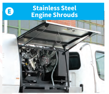
Stainless steel engine shrouds are compact, protective & noise reducing. Gull wing design makes it easier & faster to service power plant without raising an interconnected hopper/shroud assembly.