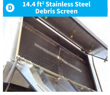
14.4 ft² stainless steel debris separator screens maximize sweeping productivity. Screens can be easily cleaned from outside of unit. Bolt-in design makes screen replacement easy.