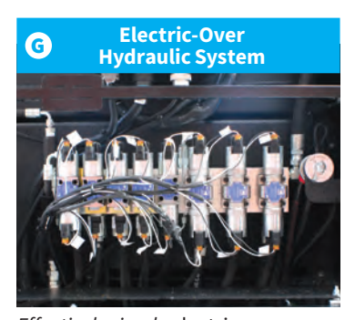
Effectively simple electric-over hydraulic valve system has reliable & easy-to-replace components. Onboard pressure gauge allows for simple servicing.