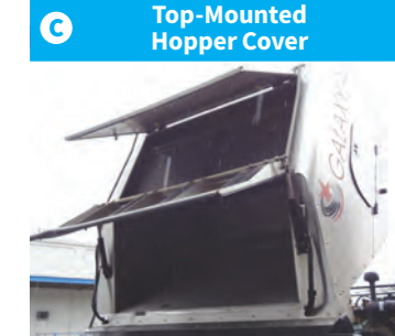
The top-mounted hopper cover opens automatically during dump cycles to provide quicker, easier & safer cleaning of stainless steel screens & hopper.