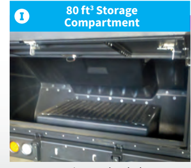
Large, one-piece polyethylene storage compartment provides nearly 80 ft³ of space for tools, tires, etc. Compartments are lockable and are illuminated with 2 LED lights