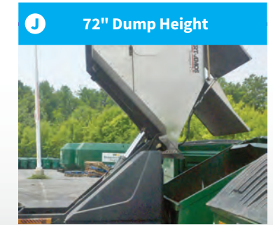
Rear 72" dump allows for convenient on-site disposal into 5'+ dumpsters. Exclusive 3" hopper slide-back feature moves hopper rear-ward allowing it to clear dumpster edges.