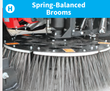
Spring-balanced, free-floating gutter brooms automatically apply correct surface pressure for maximum broom wear life. In-cab gutter broom electric tilt is standard.