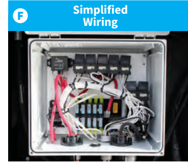
Electrical relays & fuses are protected from the elements in a sealed NEMA 4 enclosure. The wiring is heat stamped with numbers for easy identification.